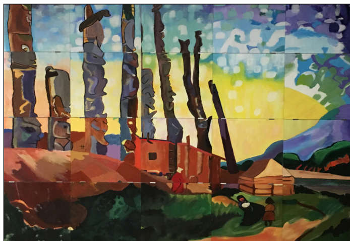
Aldergrove Secondary Art 9/10 collaborative painting

Leave request form can be found at SD35 website.